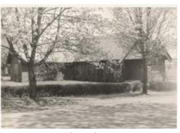
In the mid 1940s