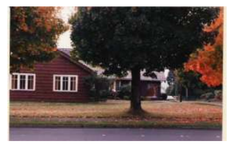
In the mid 1980s