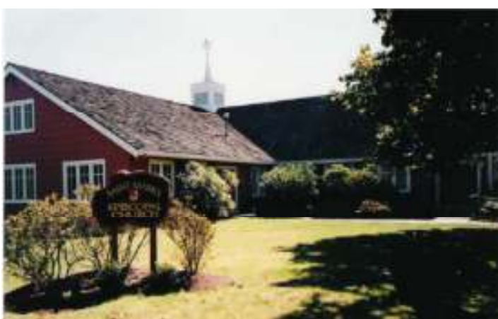
In the mid 1990s